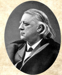
Henry Ward Beecher

"You and I do not see things as they are. We see things as we are."